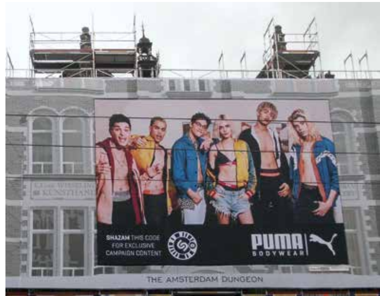
Fig. 3: Amsterdam, Rokin, September 2018, giant advertisement on scaffolding

To the surprise and shock of many, the giant advertisements were back in full glory! The Amsterdam authorities, juggling with percentages of advertisements covering the scaffolding, claim