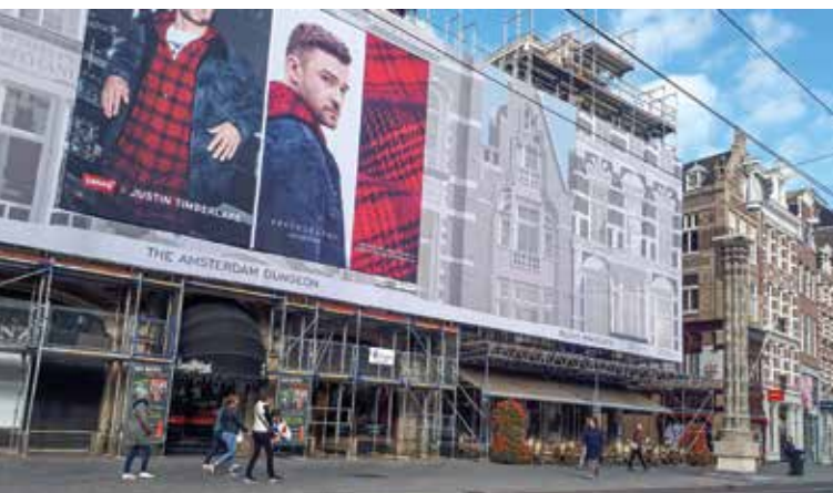
Fig. 2: Amsterdam, Dam Square, next to the Royal Palace, December 2018

that recommendation, in 2011 UNESCO took the decision (35 COM78.100) that this “practice has to stop”. Moreover, Amsterdam was included in ICOMOS’ Heritage at Risk report.