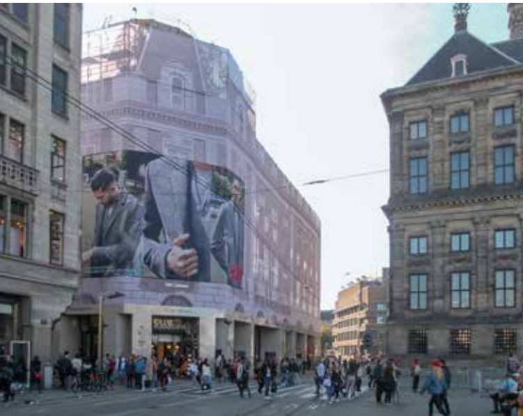
Fig. 1: Amsterdam, Rokin, October 2018

In 2010, the 17th-century canal ring area of Amsterdam was added to the World Heritage List. As in the opinion of the World Heritage Committee giant outdoor advertisements on scaffolding threaten the visual integrity of the site, “the application of measures to eradicate aggressive advertising hoardings on scaffolding” were recommended. As Amsterdam did not follow